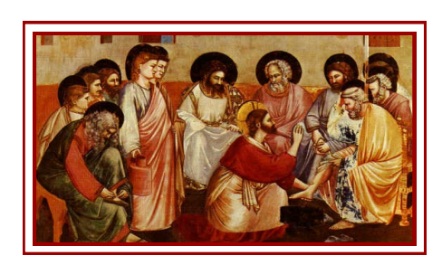
(Washing of the Feet)

The Clergy of the Parish wish you all the JOY and PEACE of the RISEN CHRIST